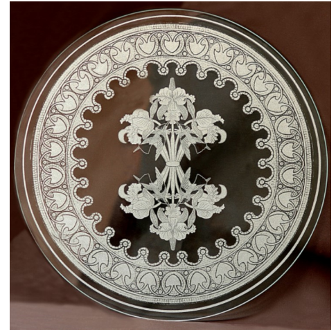
Laser Etched Glass Tabletop

The residential applications for laser etchings are excitingly diverse. From murals and decorative plaques to flooring, kitchen cabinets, counter tops and backsplashes, personalized shower door designs and everything in between, Laser Design Solutions works closely with each client to make decor dreams a reality.